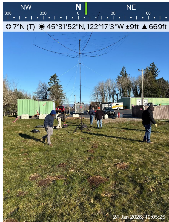
24 Jan 2026; 10:05:25

Winter Field Day has come and gone and we are anticipating June with the ARRL Field Day. The weather was cold but sunshine helped and we had no rain! The club did well with a short day operation. The radios and antennas are proving themselves. Here are a picture of the day courtesy of Chuck W7HDF.