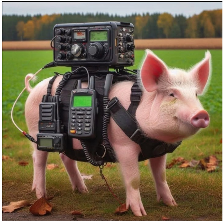
Check out the all new mobile ham radio rig