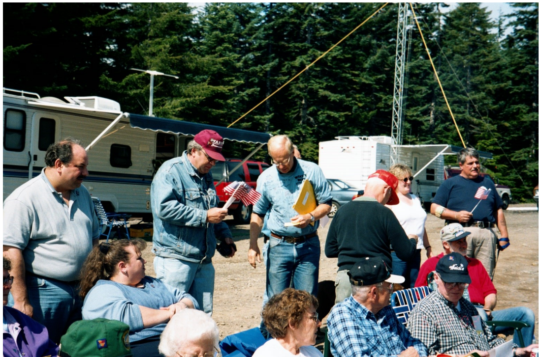
Field Day 2002—Can you name the participants?

General Club Meeting on February 20th at 7:30 PM At Mt. Hood Community College, Room 1001. Hope to see you all there.