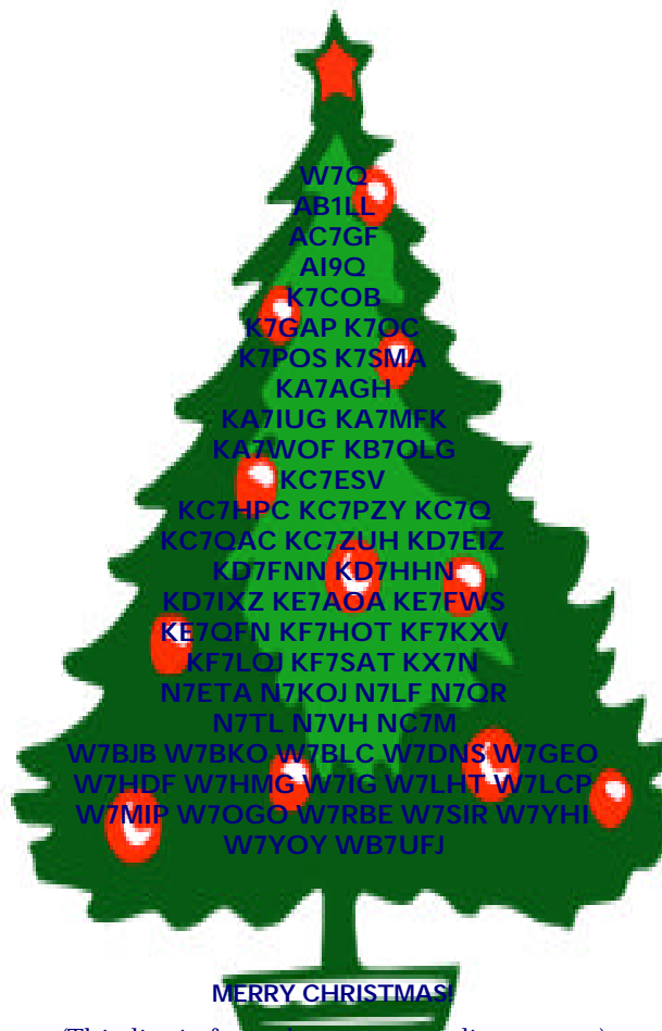
(This list is from the current online roster.)